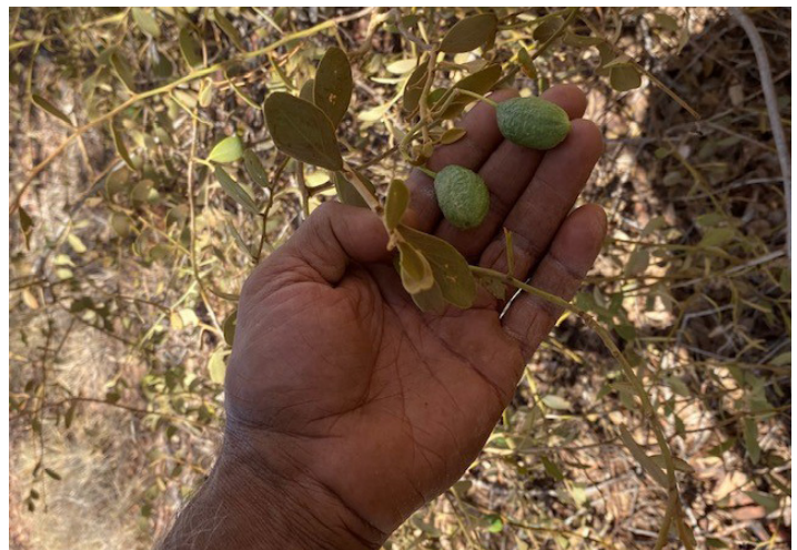
Identifying bush tucker and bush medicines are just some of the skills that the Yinhawangka Rangers are learning. Pictured above is a native passionfruit.