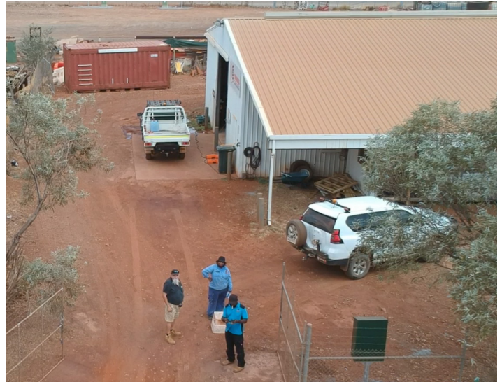
A drone view of Yinhawangka Rangers HQ on Camp Road, Paraburadoo.

The corporation has purchased two new drones for the rangers to take footage and photos out on country. We look forward to sharing some of these with the community as more spectacular scenery is captured in 2020.