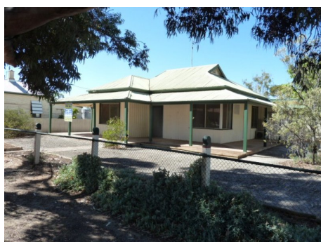
52 Arkaba Street, Hawker SA 5434

ATLA is in the process of making several repairs and improvements to these properties, and will consider, with the Advisory Group and members, how these properties can be better utilised to serve the Adnyamathanha community and also partner with the wider non-Indigenous community.