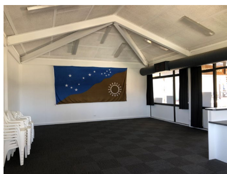
Shop 4 Complex, Black Oak Drive Leigh Creek SA 3731

With the Advisory Group, we are also engaging with various bodies to better understand how ATLA can assist in increasing ownership of housing and infrastructure on behalf of Adnyamathanha people and look forward to updating the members on these initiatives.